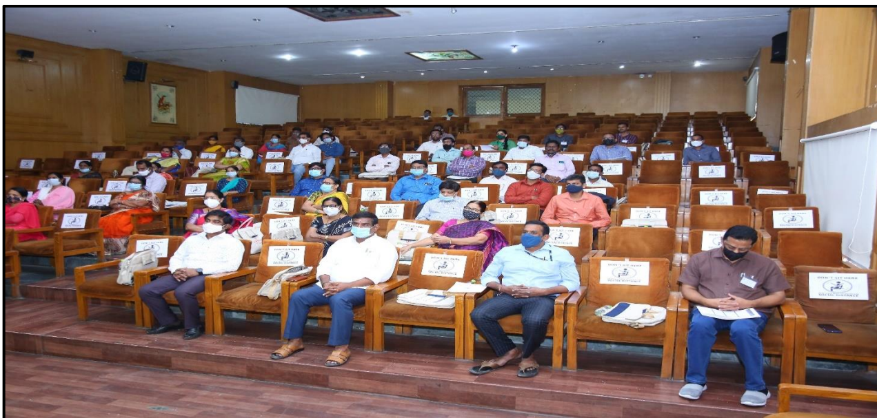
Short Term Course on “Effective Academic Administration – for the Administrative Staff of the Universities and Colleges” held from December 6-9, 2021