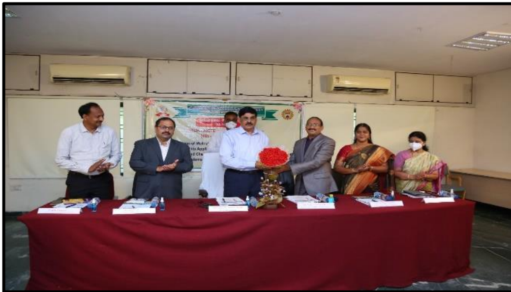
Inaugural function of three AICTE-JNTUH Short Term Training Programmes on “Seismic Design of Multi Storey buildings”, “Blockchain and its applications” and “Latest trends and challenges in Electric Vehicle Technology and Battery Management Systems” held on October 4, 2021