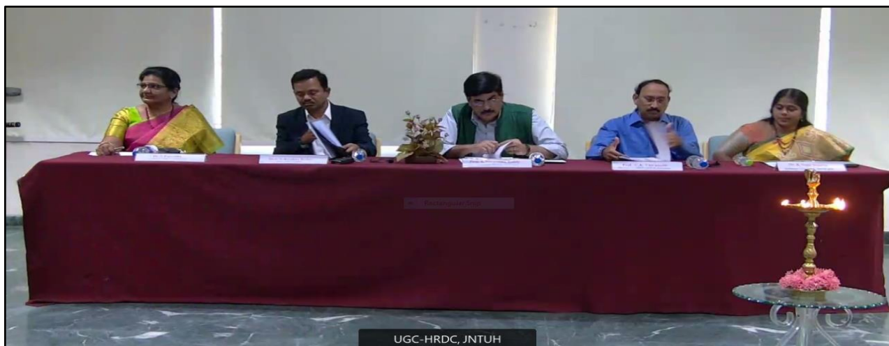
Inaugural function of two programmes UGC sponsored Short Term Course on “Softskills and Professional Ethics” and AICTE sponsored STTP Programme on “3D Printing for Sustainable Development” held on October 25, 2021

The academic administrators of the Institutions/Colleges should encourage the teaching faculty for attending the Faculty Development Programmes for their professional development. So, the HRDC of JNTUH is conducting the workshops for the academic administrators, Principals and Head of the Departments every year, to enable them to gain exposure on the changing pedagogical practices and also to encourage their respective faculty for attending the programmes.