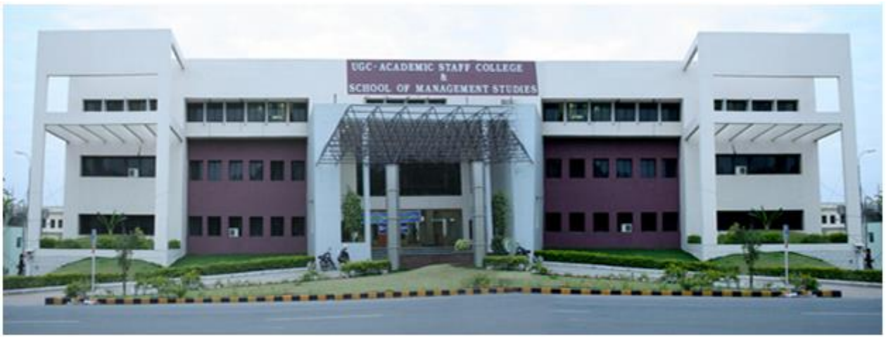
UGC-HRDC, JNTUH Building