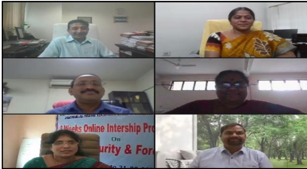
Project Monitoring Committee (PMC) of AICTE-JNTUH Joint Short Term Training Programs for the Year 2021-22 held on 28 th July 2021 at 4.00 P.M. through online